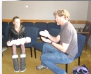
First Aid Course