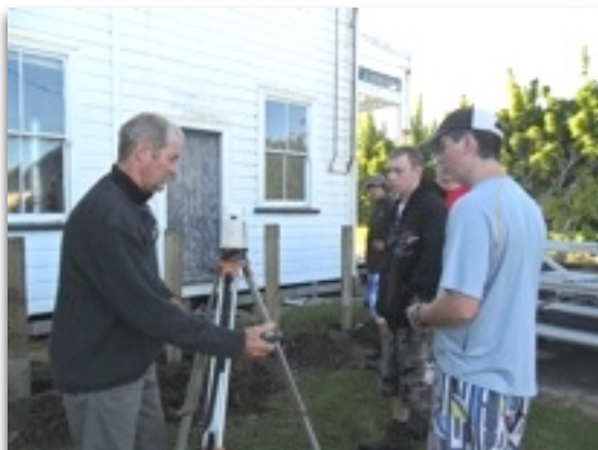
Building Students on work experience