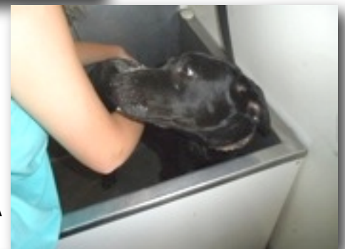
Work Experience at the SPCA