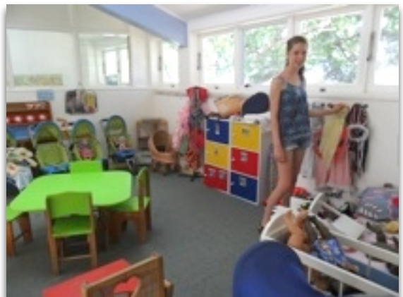
Early Childhood work experience