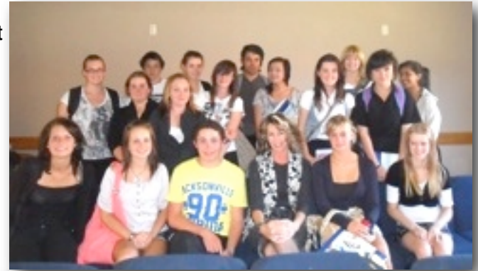
Kiwihost Course Participants

The Student Leaders also were involved in group training earlier this term. The forest course required co-operation and communication in some very unfamiliar situations.